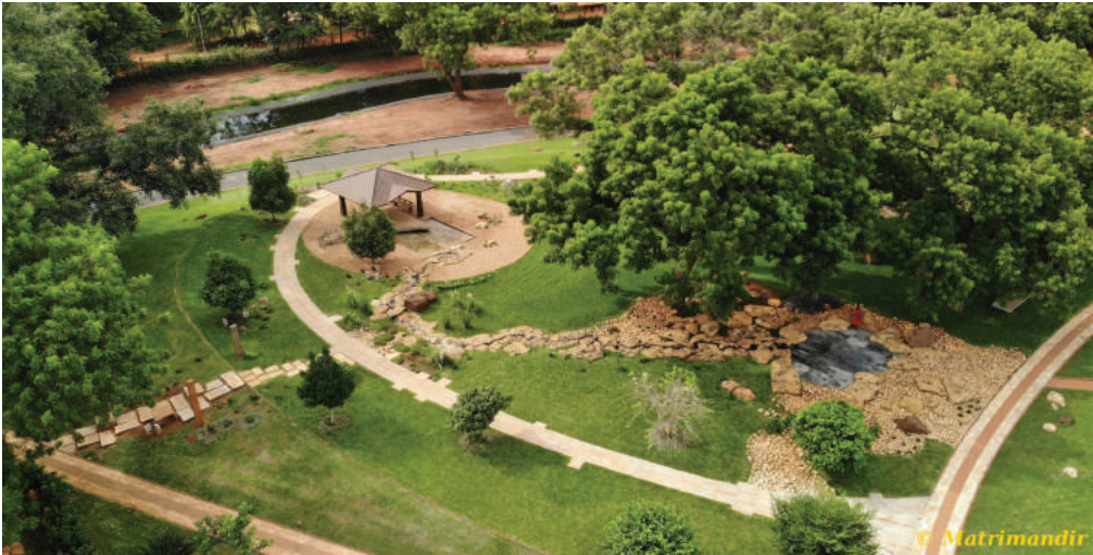
Garden of the Unexpected