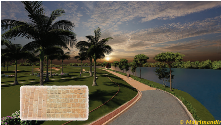
Artist's view of the Oval Road and close up of the paving stones

Collecting the runoff monsoon rainwater from the 22 acres of the Matrimandir Gardens, and feeding it into the new Test Lake to the south of the Gardens, has resulted in an accumulation of over 4 metres of water. The lake bed had been fully water-proofed in September through the installation of a 2 mm thick HDPE liner, and so will retain this precious resource during the months to come though some will slowly evaporate over the summer. Work will continue throughout this year to raise the retaining walls to their full height in readiness for harvesting the next monsoon. In addition, preparations are being made to extend the excavation.