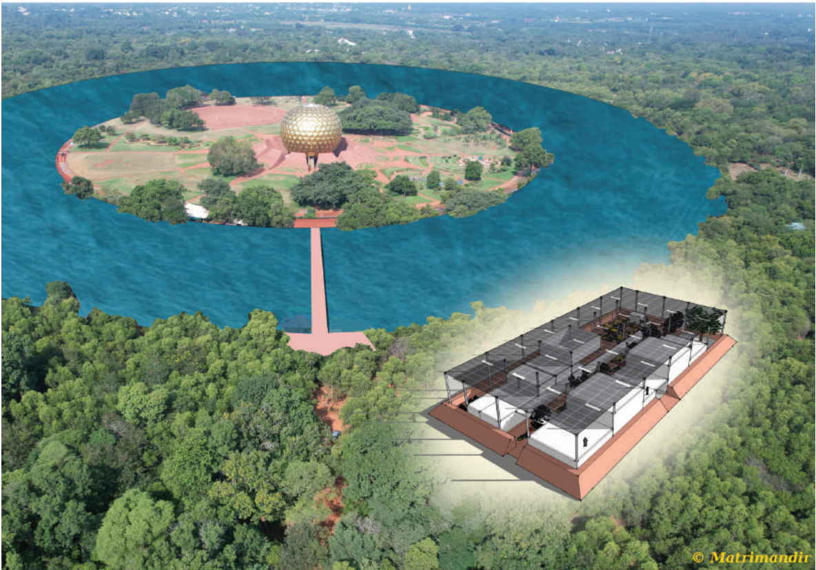
Artist's view of the Service Compound