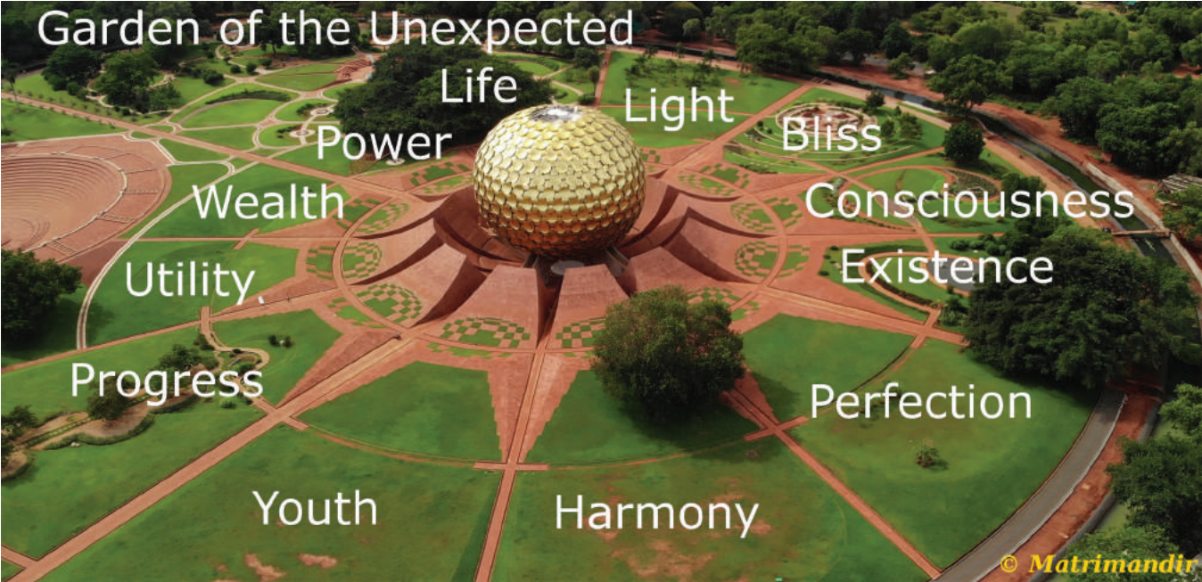
The Gardens and their significance given by the Mother