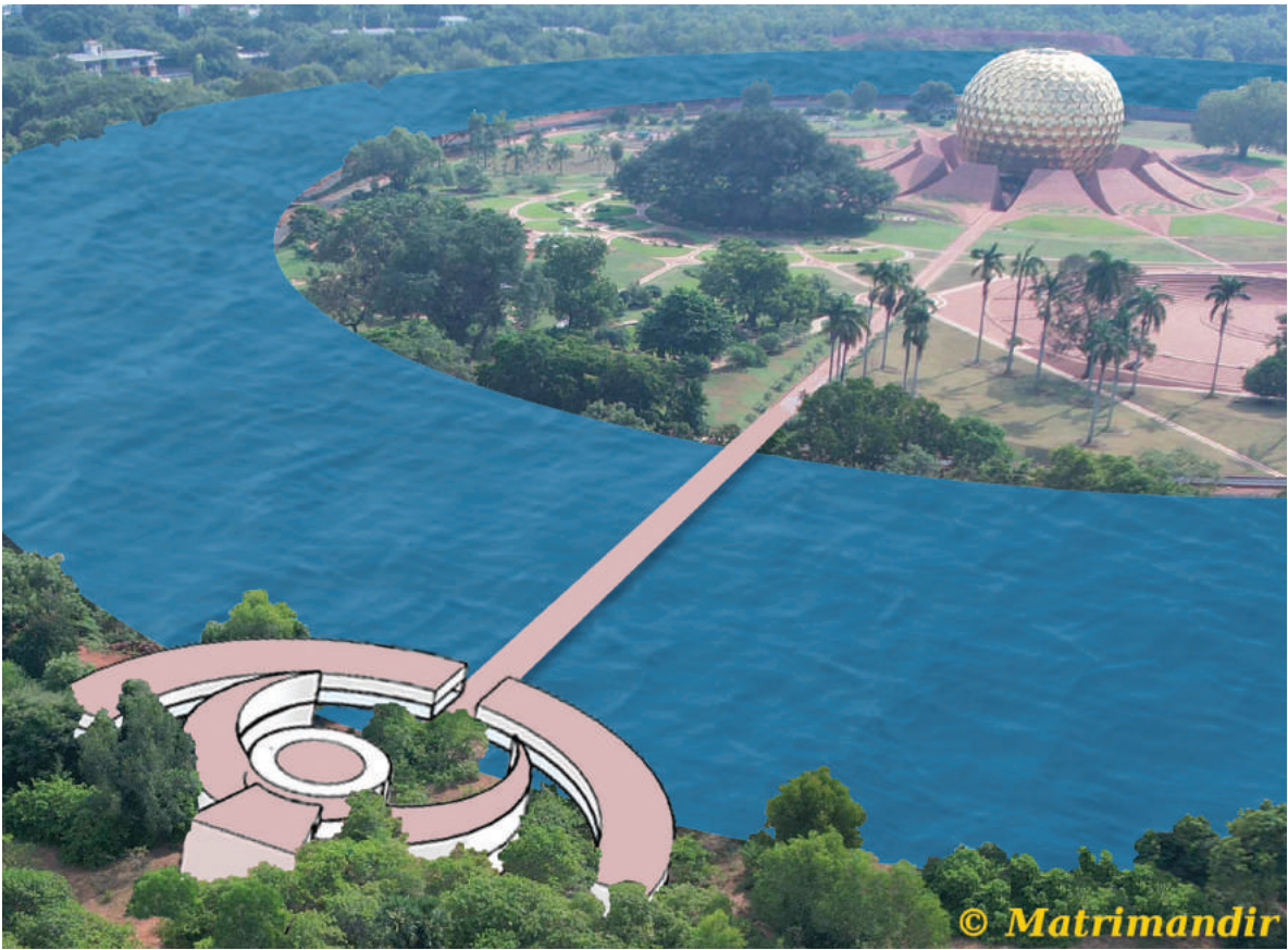
Artist's view of the Reception Pavilion, based on the design of Roger, architect of Matrimandir.