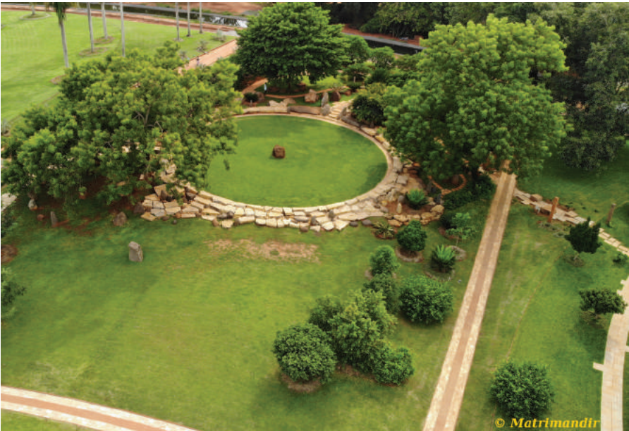
Garden of the Unexpected