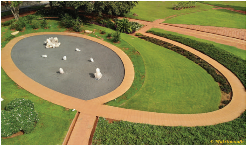
The Garden of Existence with its groups of crystals