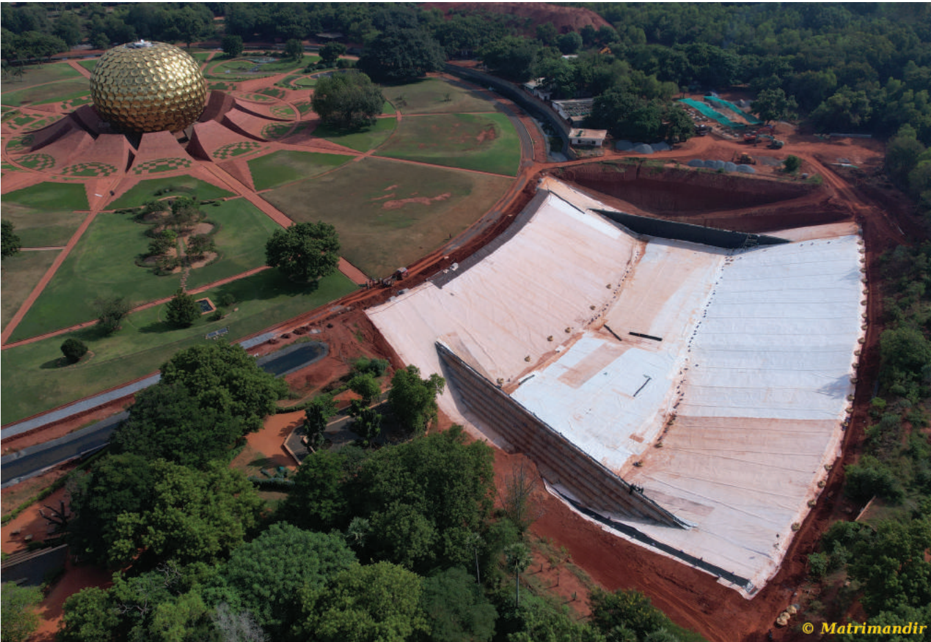
The test Lake finished with HDPE liner and protection