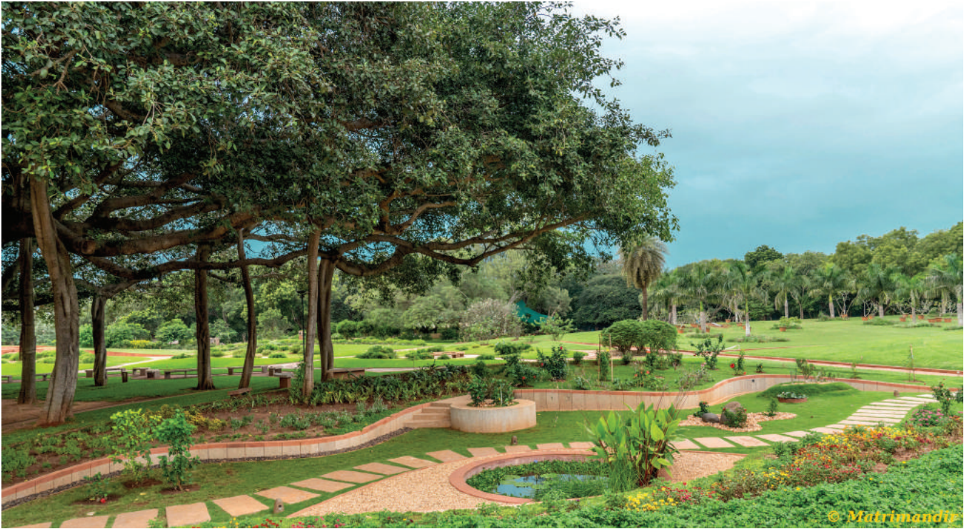
Garden of Life