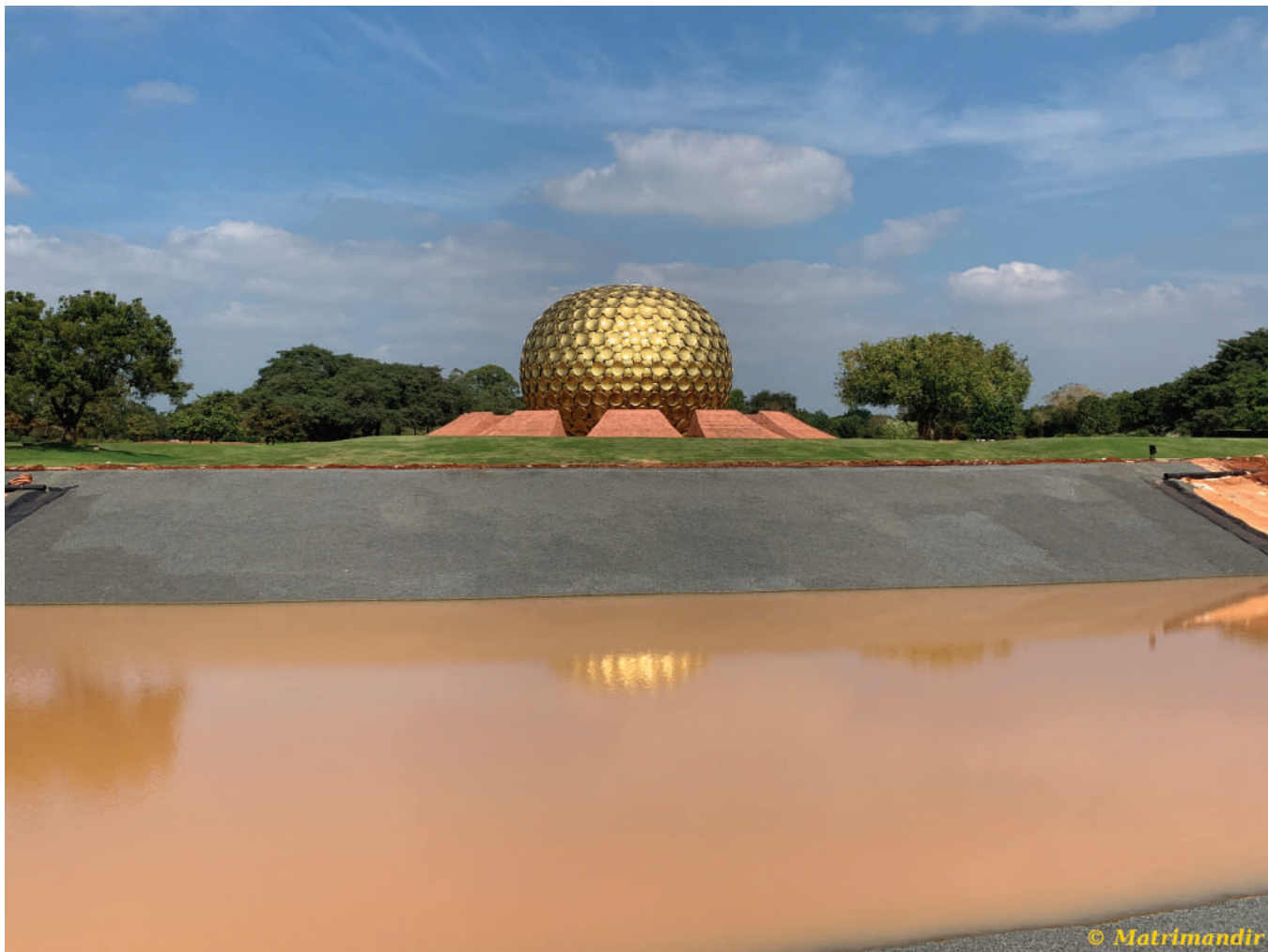
The first section of the Lake , 10% of the whole, now holds rainwater collected during the monsoon.

There is a big clean up under way in many areas in the compound which will soon give way to the Lake and, as the current public Viewing Point is also inside the lake area, a new one is being prepared.