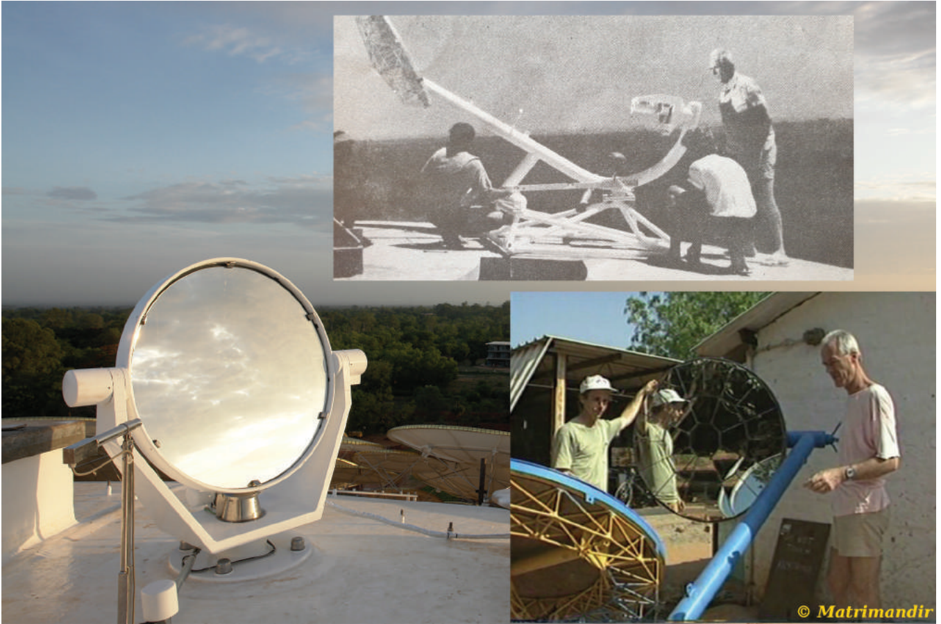
The Heliostat, which sends the Sun Ray into the Inner Chamber, has been developed through several stages over 40 years