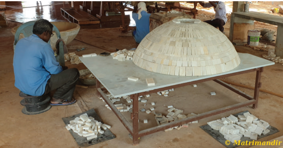
Cladding fountain bowls for the Garden of Bliss